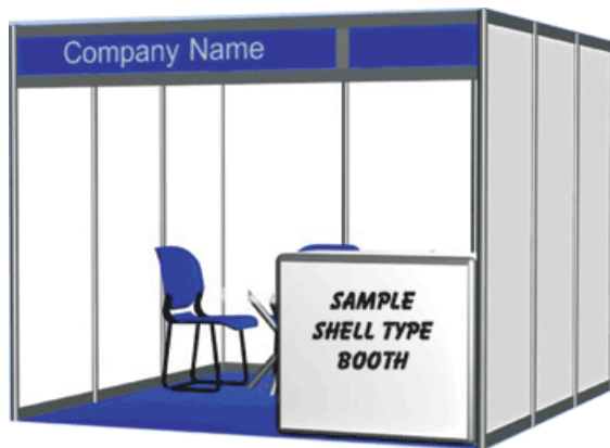
Picture of 3 x 3 sq.mtrs stall